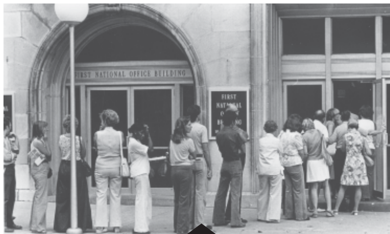
Water Street Campus