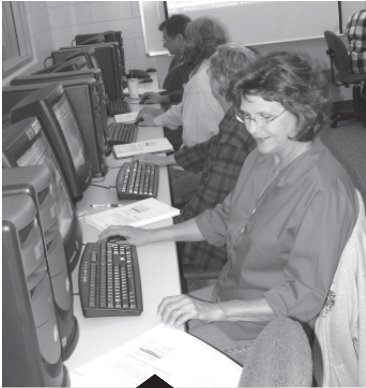
One College Park Campus