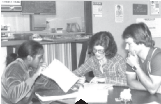
Water Street Campus