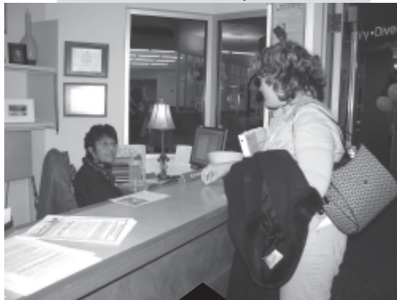
Park 101 Campus