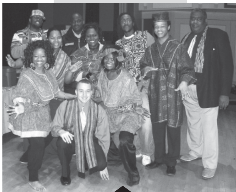
One College Park Campus