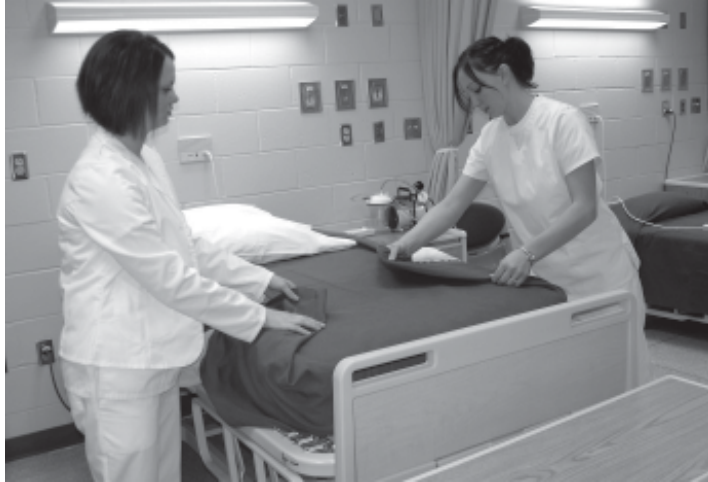
Schrodt Health Education Center