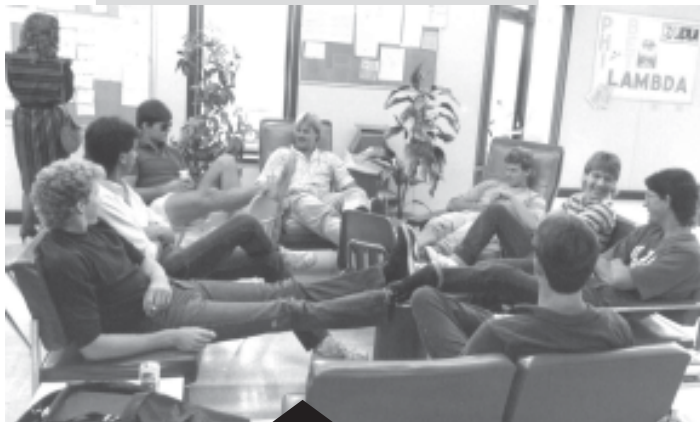
Park 101 Campus