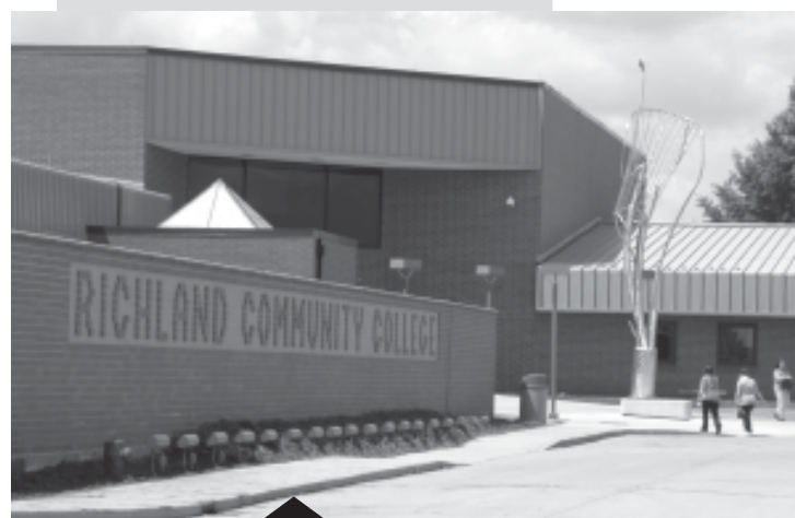
One College Park Campus