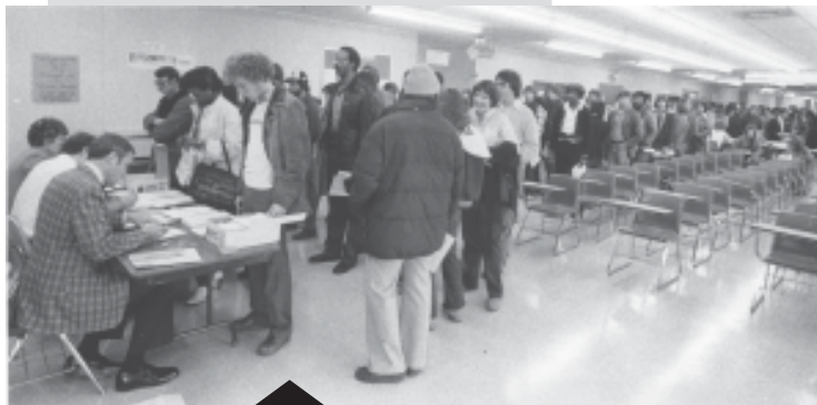
Park 101 Campus