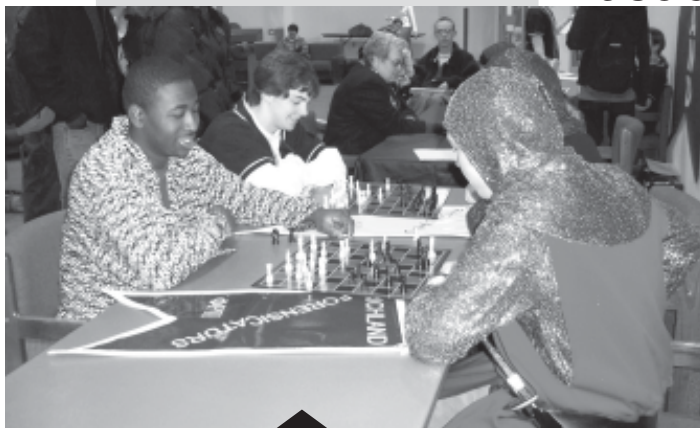
One College Park Campus