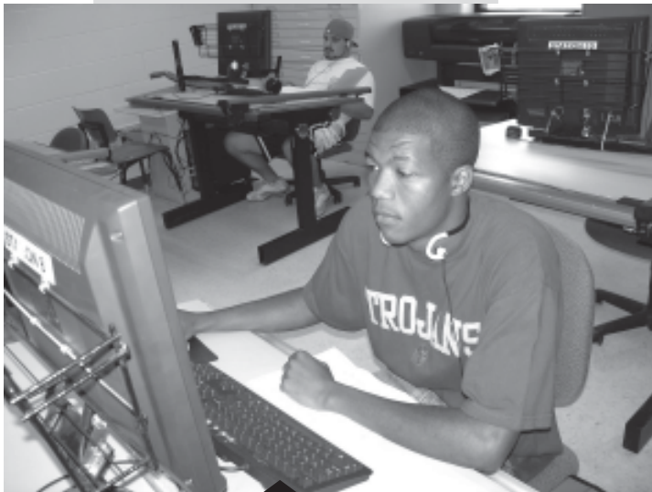
One College Park Campus