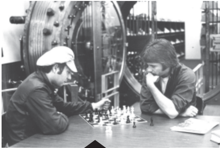
Water Street Campus