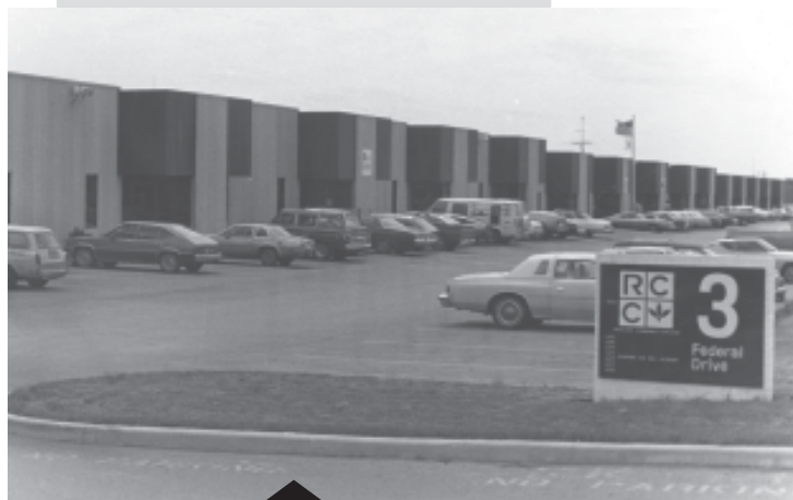
Park 101 Campus