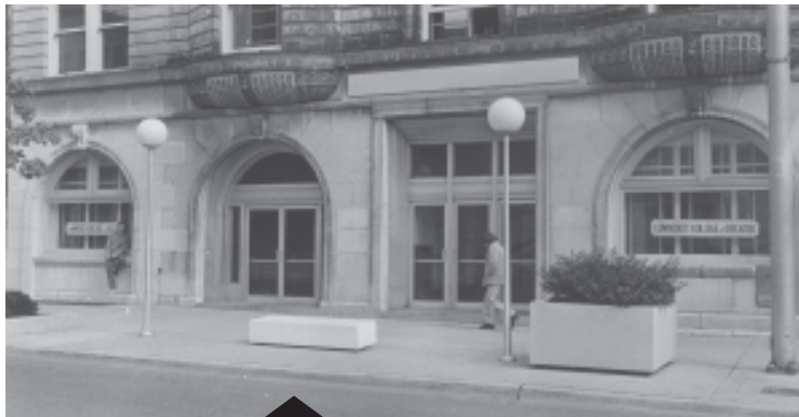
Water Street Campus