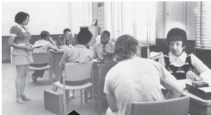
Water Street Campus