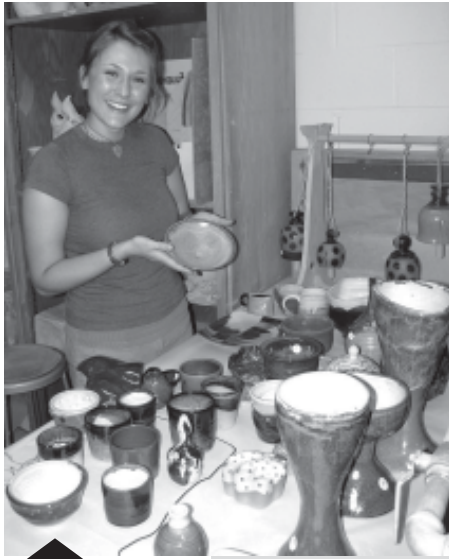
One College Park Campus