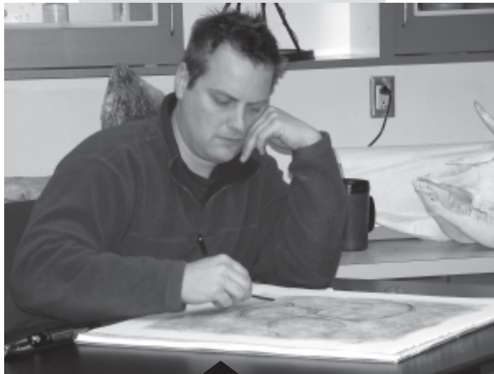
One College Park Campus