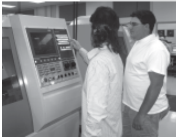
Industrial Technology Center