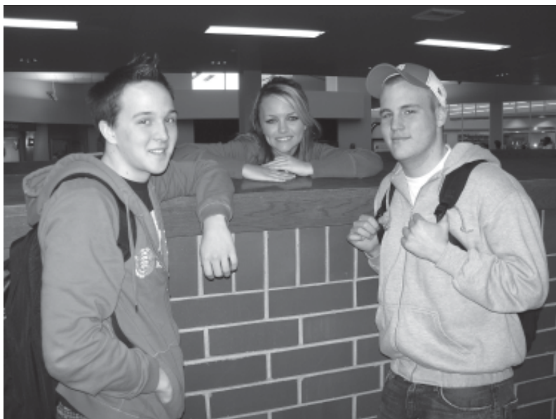
One College Park Campus