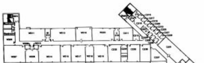
Main Building - Second Floor